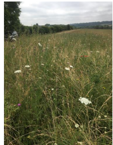
Photo 4. Wild bird seed mix in September

Photo 2. Wild flowers in the field margins.